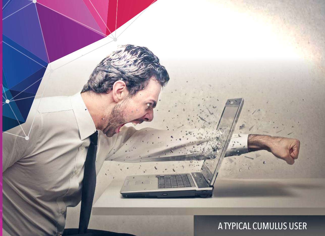
A TYPICAL CUMULUS USER